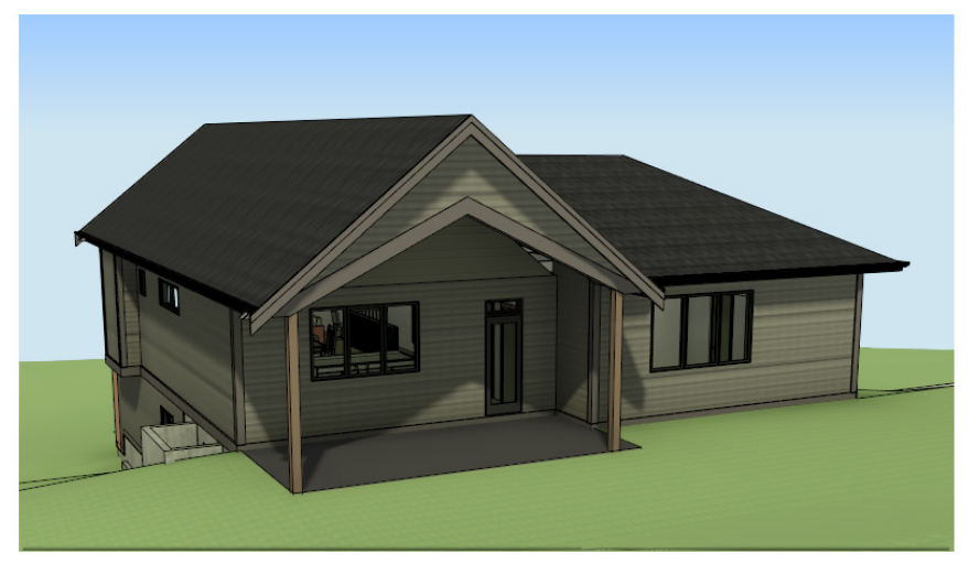
LOT 59 50202 KENSINGTON DRIVE

All images used are for illustrative purposes only and are intended to convey the concept and vision for the development/apartments/houses. They are for guidance only, may after as work progresses and do not necessarily represent a true and accurate depiction of the finished product. Floor plans are intended to give a general indication of the proposed layout only. All images and dimensions are not intended to form part any contract or warranty.